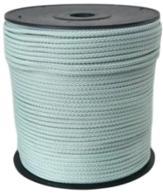
Polyester cord with a core 5 - 6 mm (recommended)