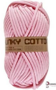
Chunky cotton yarn