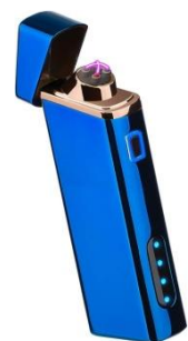
Lighter (for a polyester cord)