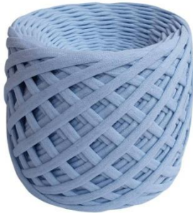
T-shirt yarn (recommended)