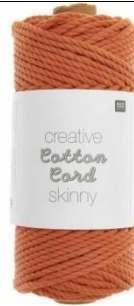
Cotton cord for macramé