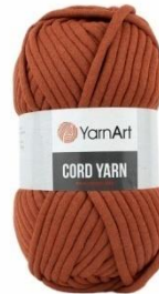
Cord yarn (cotton + polyester mix)