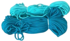
Polyester cord 3 - 4 mm (recommended)